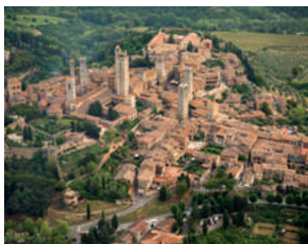
Fly above San Gimignano