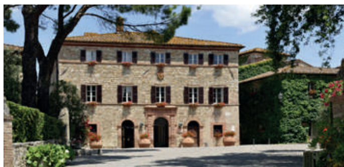
Relais and Chateaux Borgo San Felice

With the acquisition of the Campogiovanni estate in Montalcino, San Felice began producing a Brunello di Montalcino that after just a few years was named among Wine Spectator's Top 100. More recently, in 2016, San Felice purchased six hectares in Bolgheri, leading to the birth of the Bell'Aja brand. With these two additions, San Felice has affirmed its place as a reference point in the world of wine, both domestically and internationally.