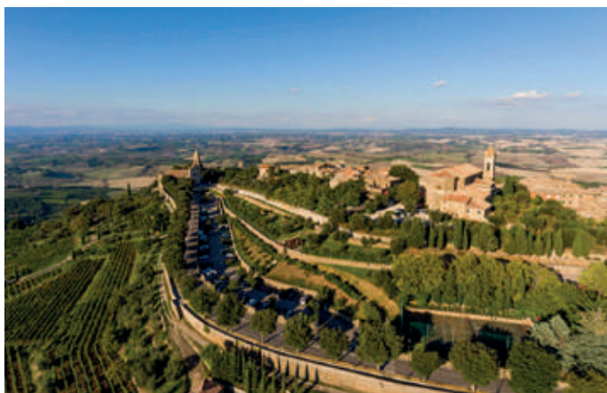
Montalcino, the land of Brunello wine

After this experience we will fly to the next area where another famous Tuscan wine is produced: Montepulciano. Viticulture here dates back many centuries to Etruscan times. According to DOCG rules, to be labeled as Vino Nobile di Montepulciano, a wine must come from vineyards on the hills which surround the village of Montepulciano. This area is made up of slopes reaching 820–1968ft (250–600m) in altitude, located between two rivers.