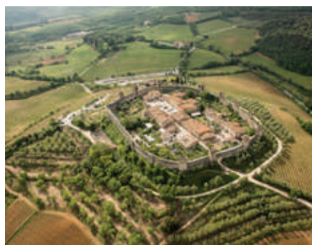
Discover the villages of Chianti

At the end of the experience, we will fly you back to Florence.