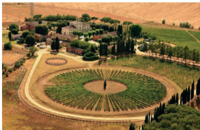
Visit at Avignonesi Winery