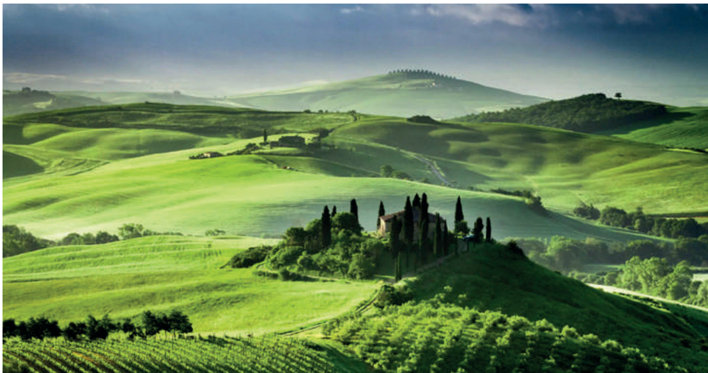
The hilly landscape of Val d'Orcia