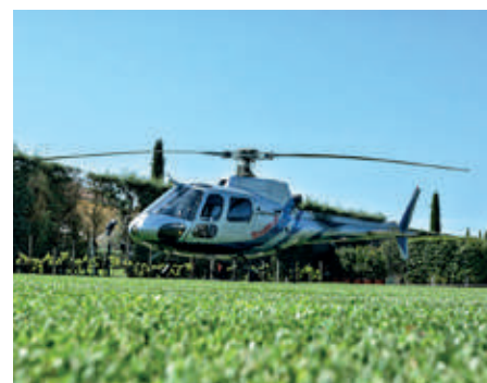
Tenuta Torciano helipad