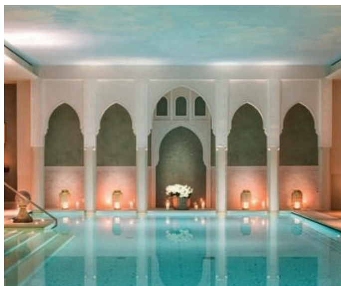
Palazzo Parigi spa