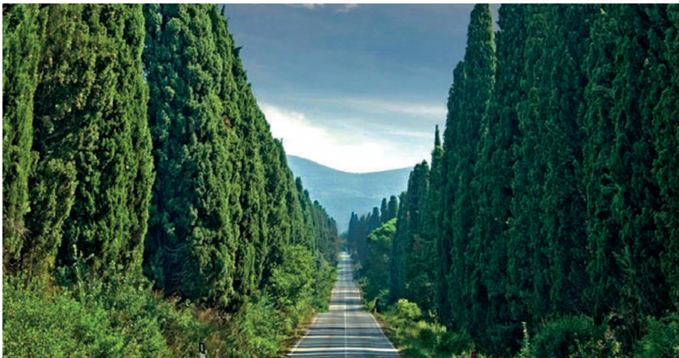
Cypress-shaded road in Bolgheri