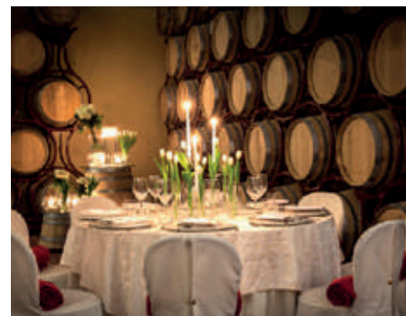
Have lunch in the winery