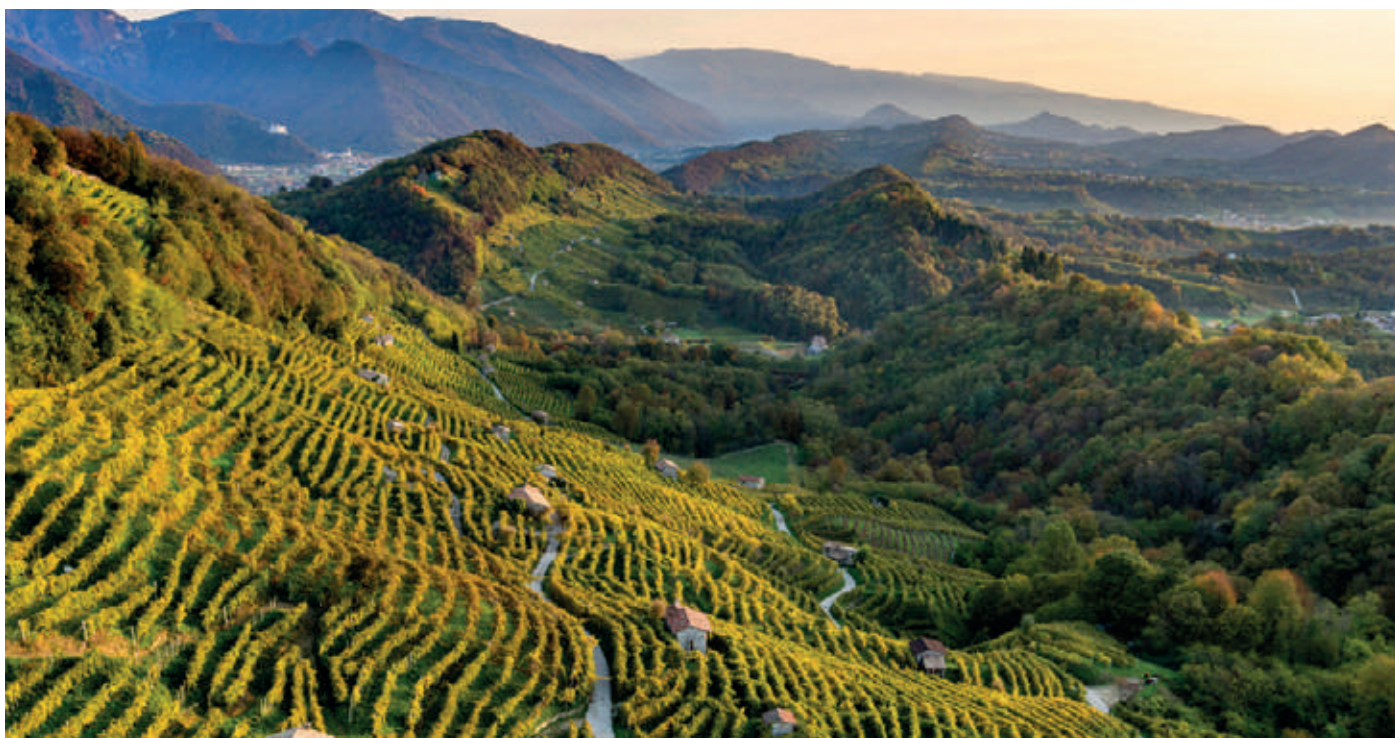
Colosseum in Rome