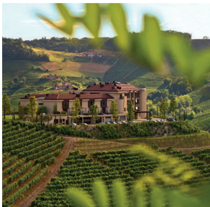
Boscareto Resort & Spa