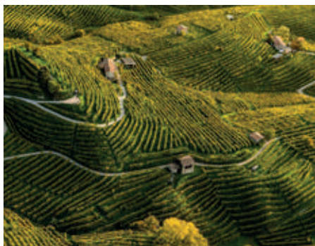
The prosecco route

The amazing beauty of the hills surrounding Conegliano, expressing their calm and natural serenity since '400 C paintings, transpires today among farmhouses, precious vineyards, historical sites and unexpected breathtaking views, overlooking the valley towards Venice or towards Cortina's Dolomites. Venice is only 50 km away while Cortina less than 100 km.