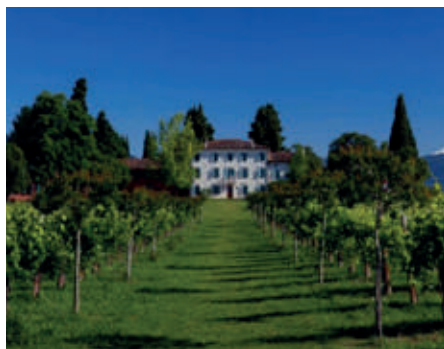
Relais Ca' Milone