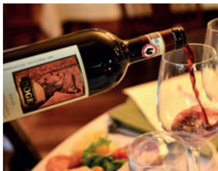
Taste the most renowned Tuscan wines